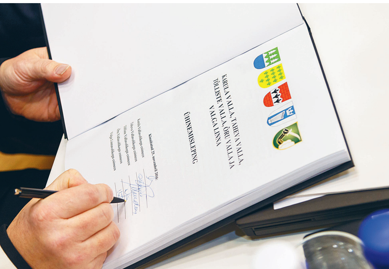
Chairs of the municipal councils of the city of Valga and the rural municipalities of Õru, Karula, Taheva and Tõlliste signing the merger contract establishing the municipality of Valga.