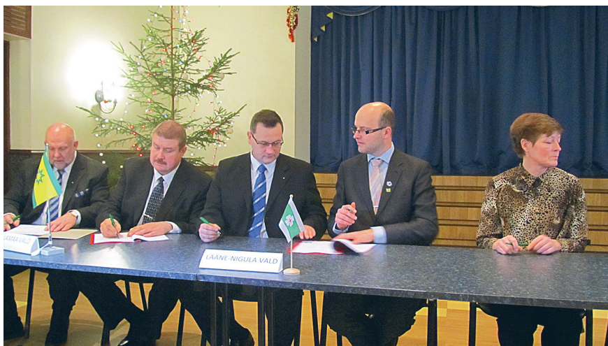
Signing the merger contract in the rural municipality of Lääne-Nigula and establishing the rural municipal districts.

Councils of rural municipal districts have three 15 to fifteen members, but most commonly it is seven members.