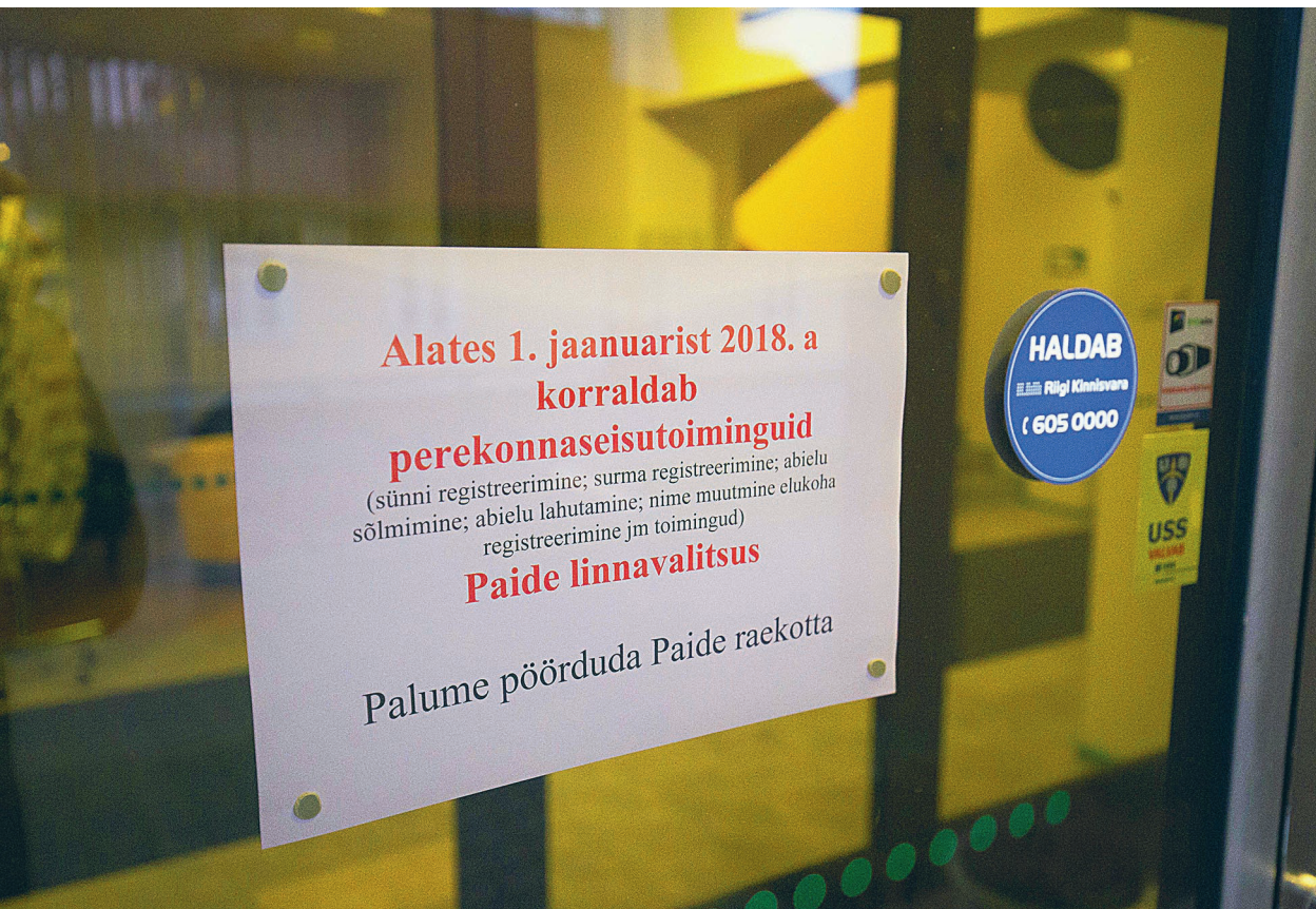
A notice on the door of the former Järvamaa County Government in January 2018.

within agencies have no legal meaning, and they are a matter of division of work within each agency separately.